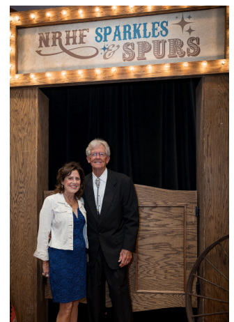
Photos from the 2025 Ambassador Ball