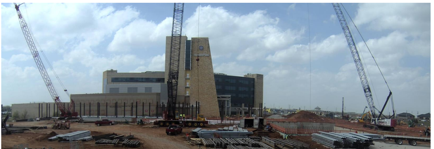
Three Crawler Cranes working on the HealthPlex.

Please direct any questions or comments regarding our Inspire Health project to: InspireHealth@nrh-ok.com