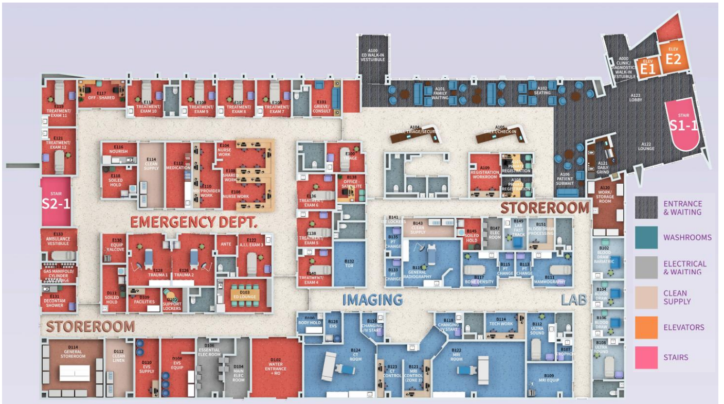
Norman Regional Nine First Floor