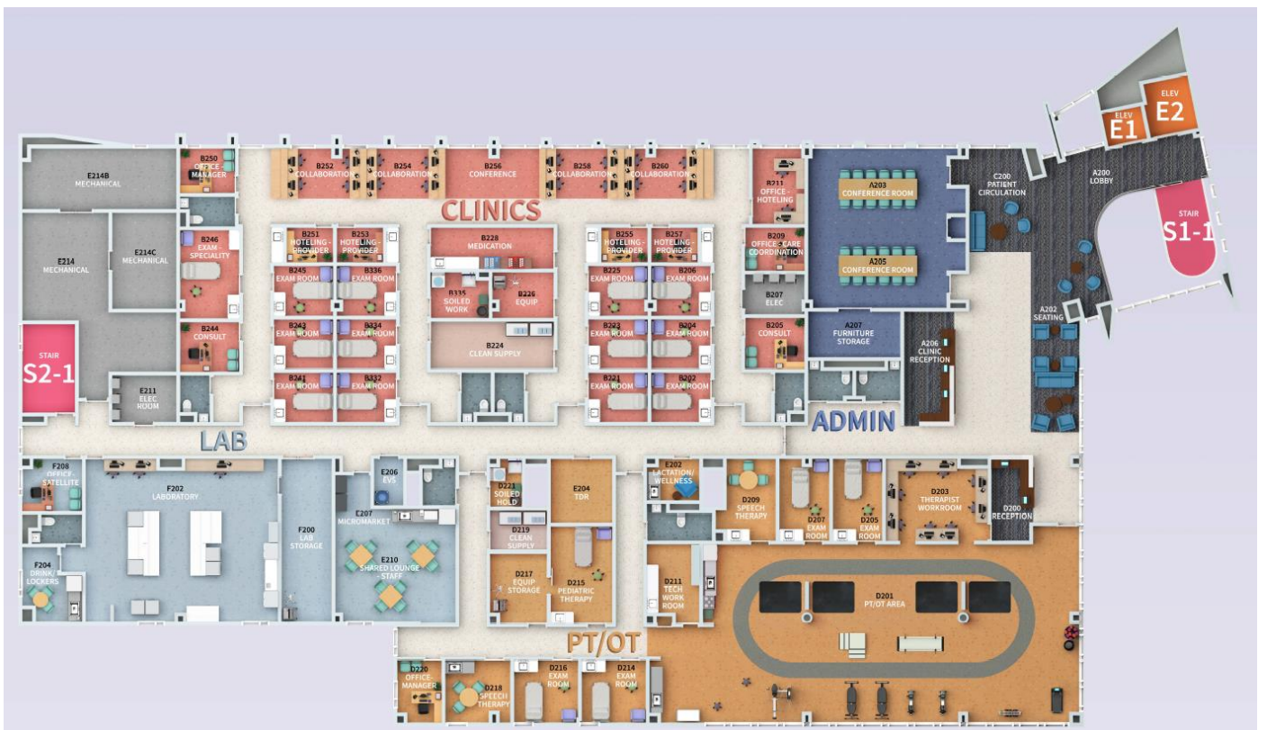
Norman Regional Nine Second Floor