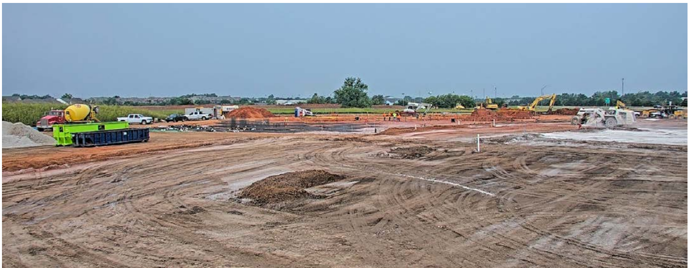
Work continues inside the construction zone at the Free Standing ED Site

In 12 months we will have access to the new FSED building to begin our transition and activation work...12 MONTHS!