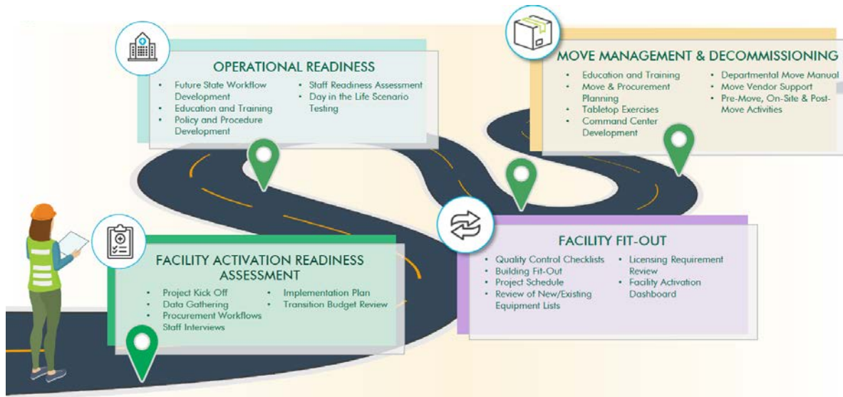
Facility Activation Process Overview