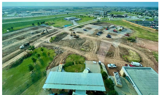
Work continues inside the construction zone at the HealthPlex