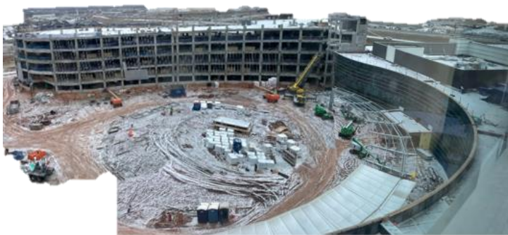
Structure nearing completion