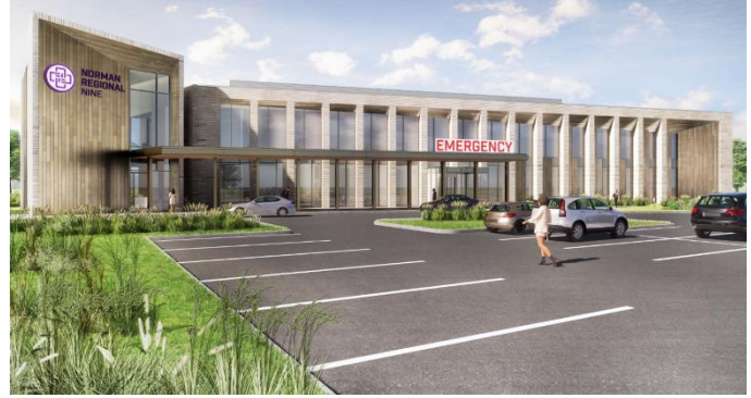
How Norman Regional Nine looks today