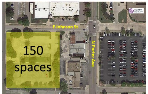
Anticipated temporary healer parking