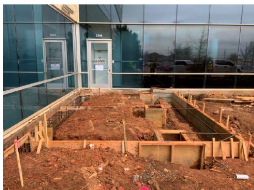
Temporary EMSStat Entrance