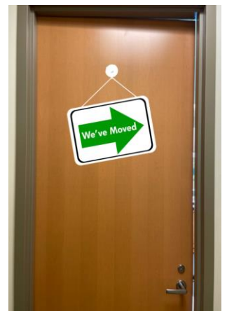
Healer offices and work spaces will be impacted by construction