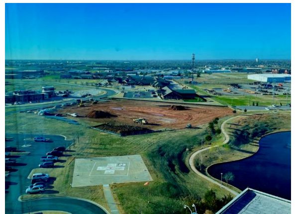
Parking Lot A Construction Underway!