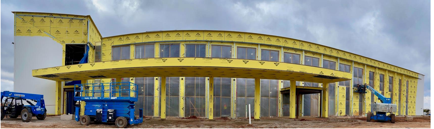
Front view of Norman Regional Nine as of March 2022