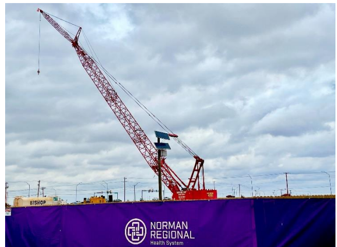
Crawler Crane #1 is set up on site