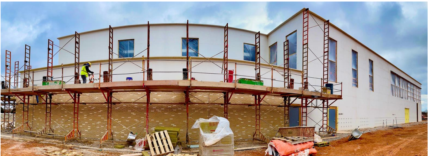
South portion of the building with brick application currently underway