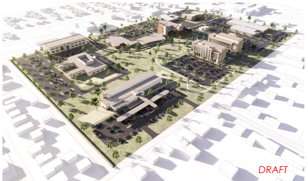
Porter Health Village Master Plan

Be sure to visit https://inspirehealthok.com for more information!