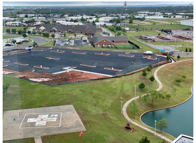
Parking Lot A Construction Underway!