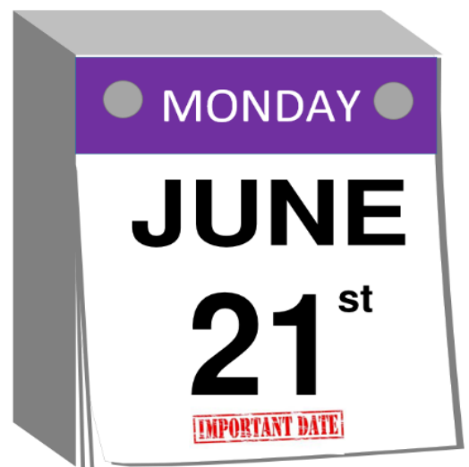
Opening of Parking Lots A, D, and F.

Please direct any questions or comments regarding our Inspire Health project to: InspireHealth@nrh-ok.com