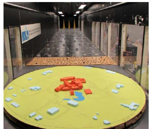
HealthPlex model in wind tunnel