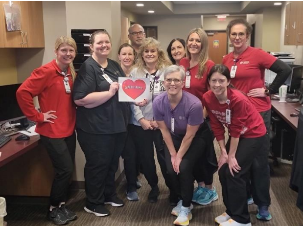
Heart Plaza Imaging