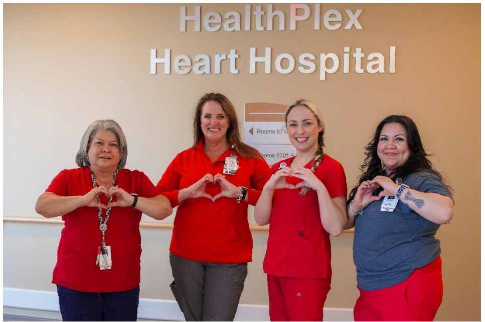
HealthPlex Healers have a heart!