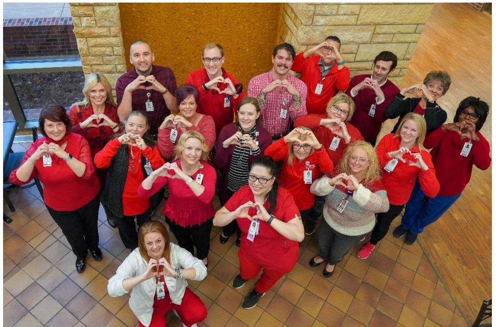
Porter Healers show the love!