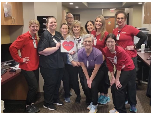
Heart Plaza Imaging